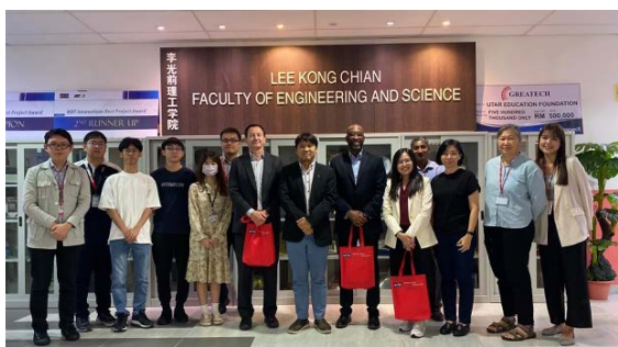
Meeting with University Tunku Abdul Rahman (UTAR).

Society of Actuaries (SOA) at that time, as the CAS was not mentioned on the website or in the program brochures. However, the visit proved to be very productive. Both the university and CAS representatives agreed on the importance of increasing the visibility of CAS on the university websites or program, recognizing the value it offers students interested in the property and casualty path.