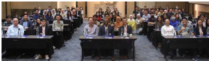
ASM-CAS joint seminar.