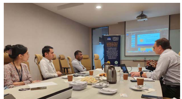
Meeting with Asia Pacific University (APU).