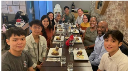
Dinner with University of Malaya.