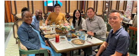
Dinner with ASM representatives.

There were other sessions provided by ASM, e.g., digital insurance in Malaysia, earthquakes in Malaysia and a panel discussion on electric vehicles.