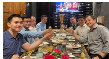
Gathering with actuarial managers from local insurance companies and representatives of the IAV.