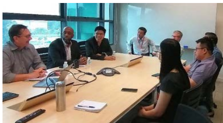
Meeting with Heriot-Watt University.