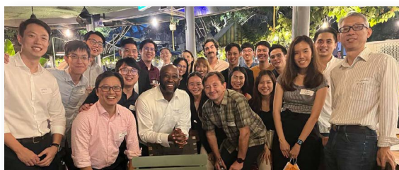
Singapore members networking