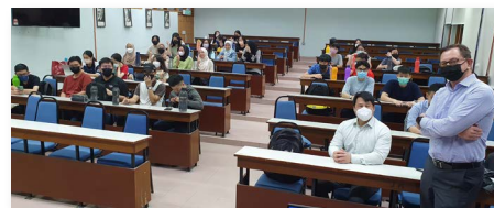
Visit University of Malaya, Malaysia

https://ar.casact.org/cas-leaders-visit-singapore-malaysia-and-vietnam/