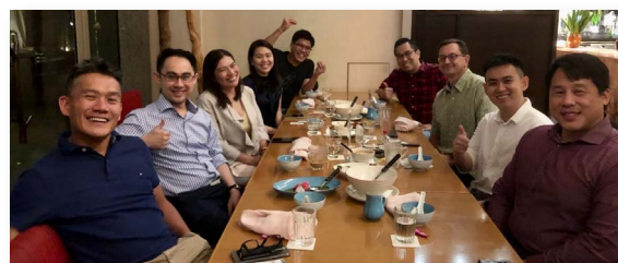
Dinner with Actuarial Society of Malaysia