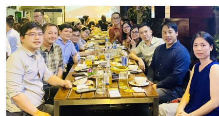
Evening drink with Vietnam actuaries